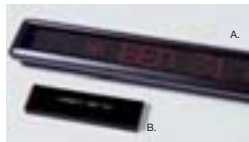
A. EXTRA LARGE LED DISPLAY B. LARGE VFD DISPLAY Full text with sounder to indicate alarm type and location.